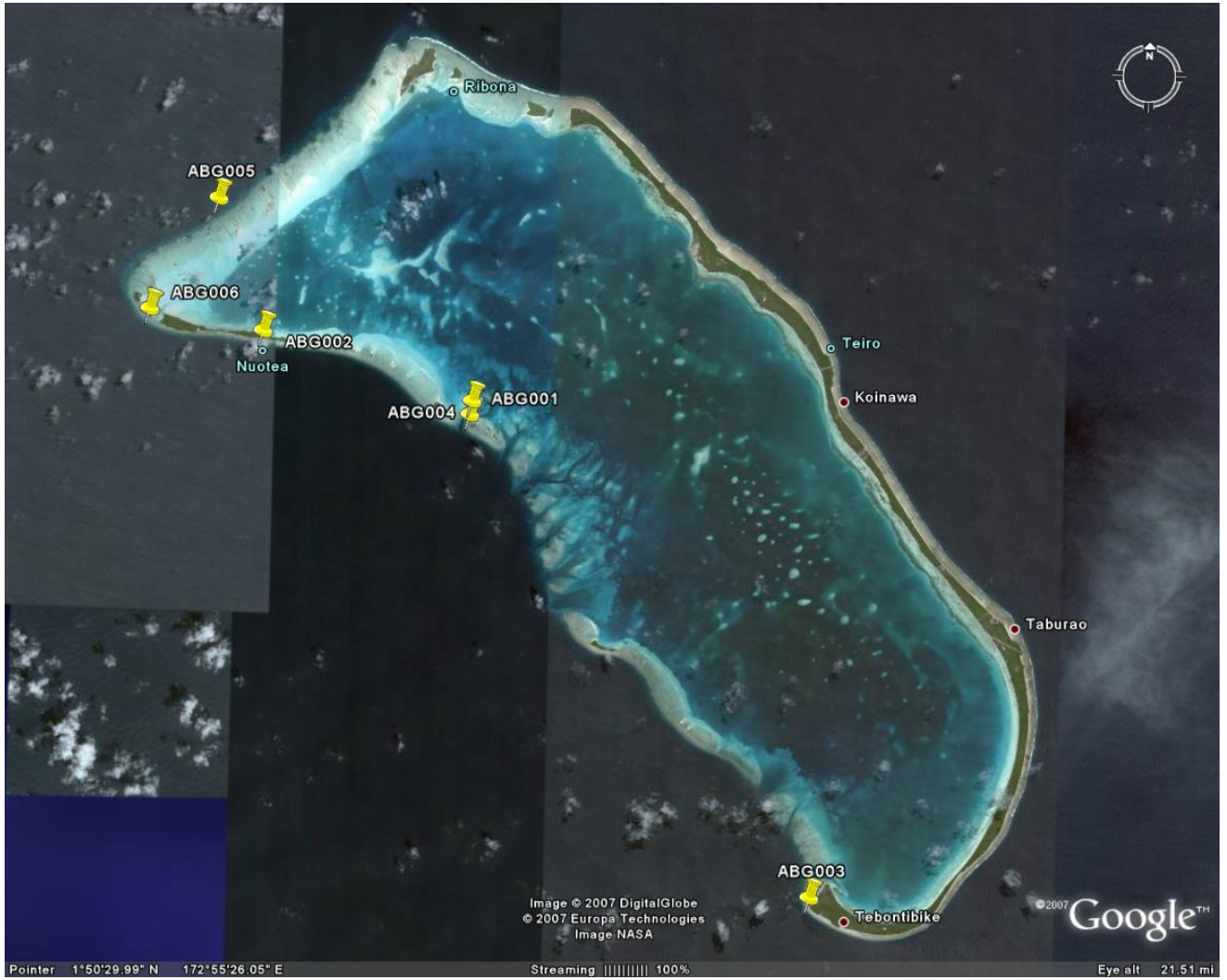
Abaiang site map, created with Google Earth. Sites include permanent monitoring sites and locations visually surveyed during Nov 22-24, 2007 expedition.