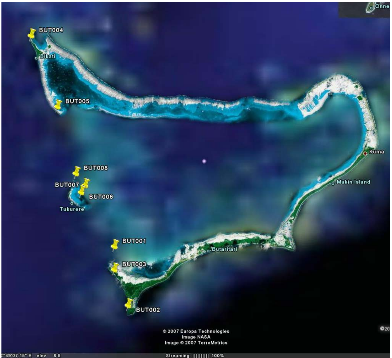
Butaritari site map, created with Google Earth. Sites include permanent monitoring sites and locations visually surveyed during Nov 4-8, 2007 expedition.